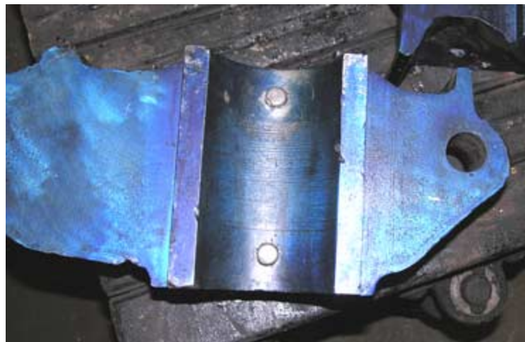
New dowel pins

Trucks – The second truck component to be reassembled was a truck bolster . This was completely sand blasted (actually glass blasted by A.C.) then painted black by STM. All new bolts were used. It is now in the ‘box’ on top of the rebuilt spring plank assembly, awaiting installation.